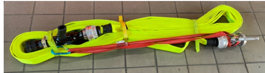
Fast attack hose package