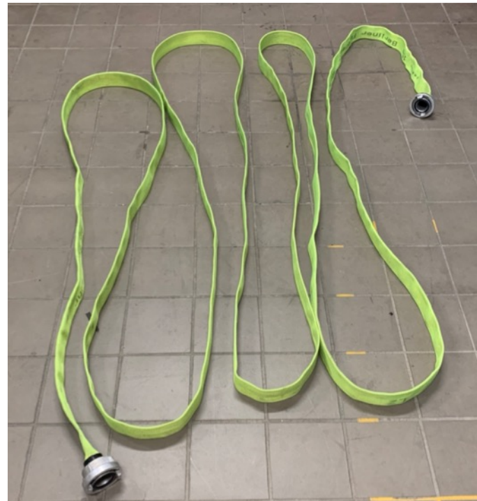
Perfect Hose management