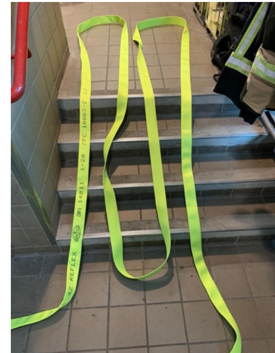
Use the gravity