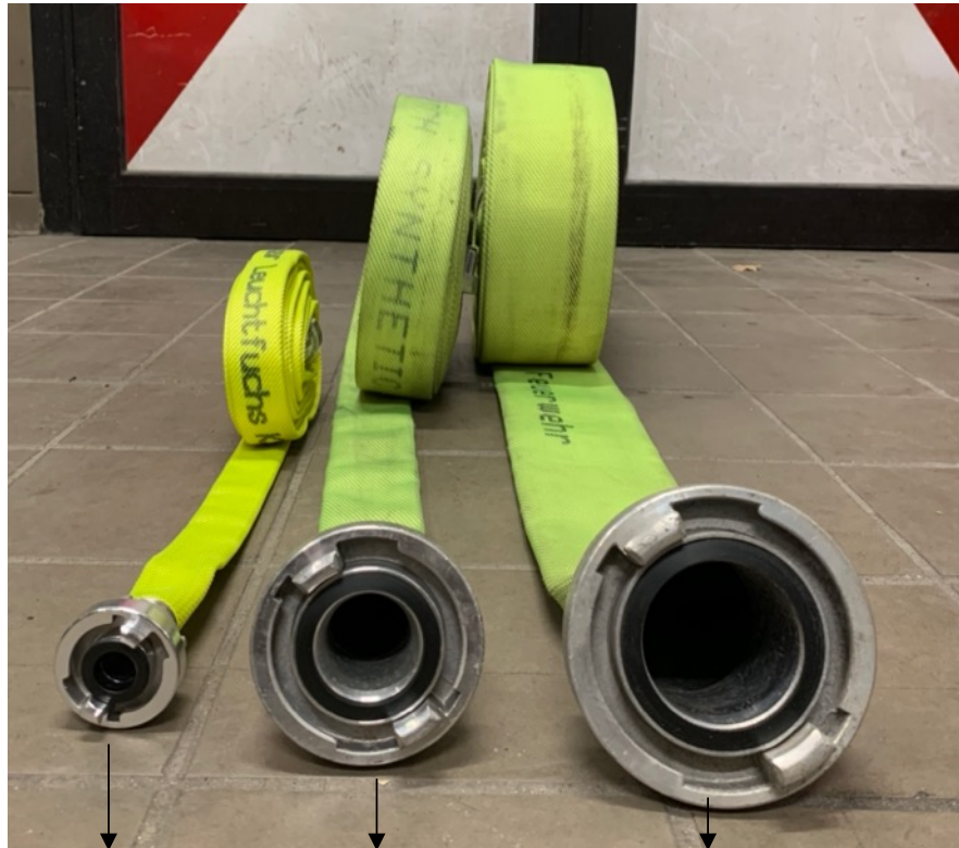
D - Hose 25mm C - Hose 42mm B - Hose 75mm