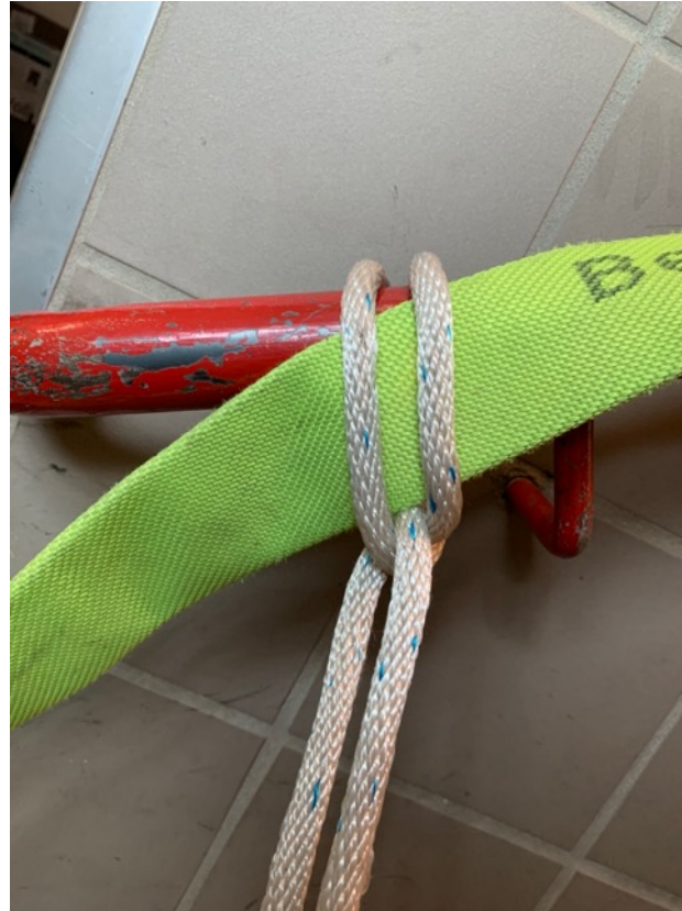
Secure the hose