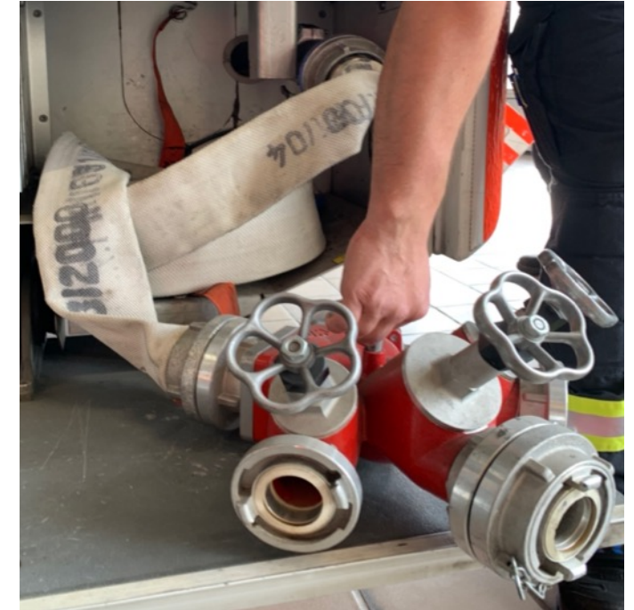
Hose on the distributor