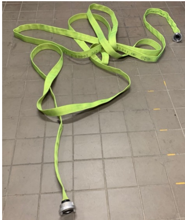
Danger of tangling