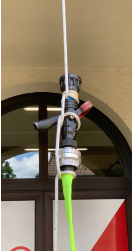
Pull the hose trough a window