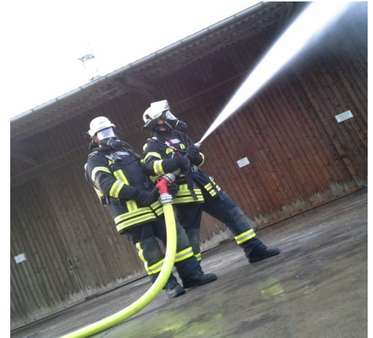
3 firefighters or 2 with a 3'rd Hand